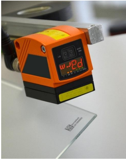
Image 7: The machine-readable laser marking enables real-time production monitoring and optimisation of the downstream process.