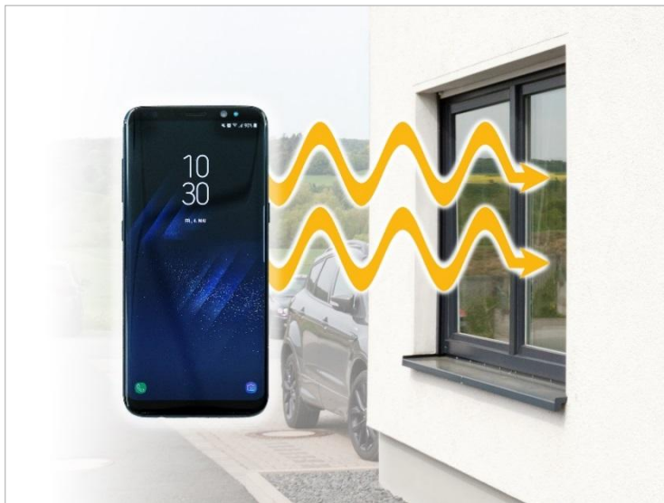
Image 4: Laser processing for smart glass with greater mobile radio wave penetration: perfect for conference rooms, offices and public transport.