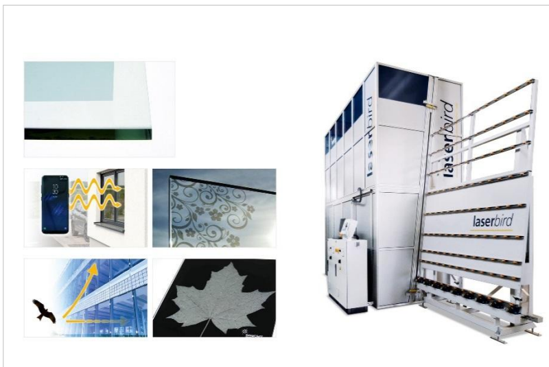
Images 1-2: The Laserbird can be used to produce custom, functional and decorative glass products.