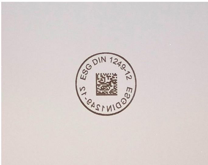
Image 6: A unique, machine-readable marking allows the glass pane to be identified at any point throughout the production process. The marking is printed on gently without damaging the surface of the glass.