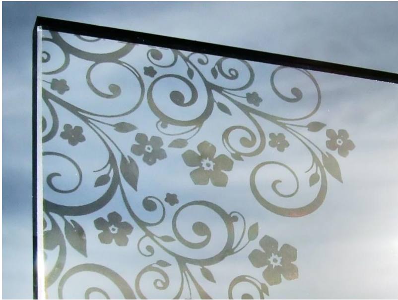
Image 3: The lasering process is gentle on the glass, and can be used to add custom decorative finishes to single glazing, laminated glass and IGUs without special set-up or tooling times.