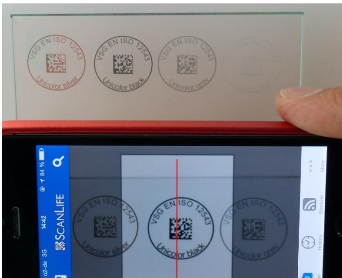
Image 8: Depending on data storage procedures, the entire production process for a single pane can remain traceable years later, making it possible to find useful information such as who installed the end product.